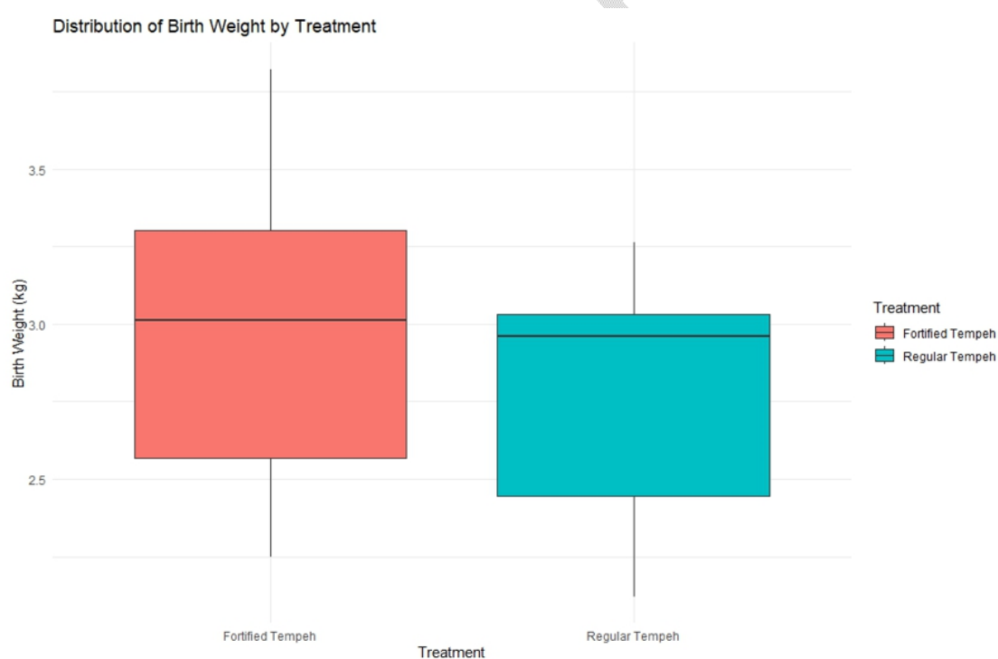
Figure 1. Distribution of mean birth weight by treatment. This figure compares average birth weights between infants born to mothers consuming fortified tempeh versus those consuming regular tempeh