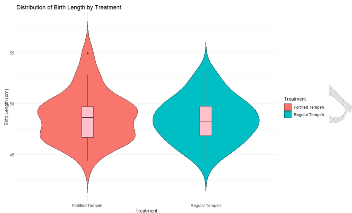
Figure 2. Distribution of mean birth length by treatment. This figure presents the average birth lengths of infants from both treatment groups, highlighting differences between fortified and regular tempeh consumption