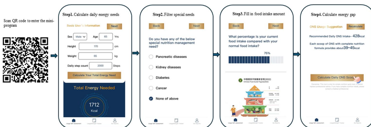
Figure 1. Operational diagram of the nutrition self-assessment app. Scan the quick response code to access the App. Under the supervision of a healthcare professional, oral nutritional supplement (ONS) users can enter their data on sex, age, height, weight, and daily step count, which the program uses to automatically calculate the total energy expenditure (TEE). Users then enter the percentage of their current food intake relative to their normal intake. The program calculates the energy deficit based on the TEE. Finally, the App recommends the required amount of ONS.

Between October and November 2023, 440 participants who met the inclusion criteria were enrolled. After excluding 17 participants, 5 because of missing participant identification numbers (IDs), 3 with duplicate IDs, and 9 with incomplete age or sex data, 423 participants were included in the final analysis. The mean age was 60.7 \pm 17.5 years, with 188 females (44.4%), and the average body mass index (BMI) was 21.0 \pm 4.2 \text{ kg/m}^2 . The NRS2002 scores were distributed as follows: 219 participants (51.9%) scored 3, 120 (28.4%) scored 4, 70 (16.6%) scored 5, and 13 (3.1%) scored 6. The demographic characteristics are summarized in Table 1.