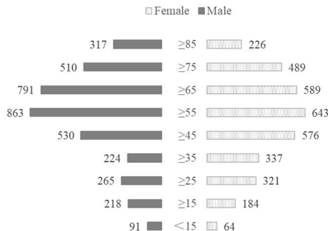
Figure 2. Number of visit records in different age range and gender. Y-axis: age ranges (years); X-axis: number of visit records in different gender (n).

patients (60.0 vs. 57.0) (Table 1). A lower percentage of male patients was between 25 and 54 years of age than other age groups, and the lowest percentage of males was in the 35-44 age groups (Figure 2). In terms of residence, patients were from 31 provinces of China, most patients lived in Chengdu (n=4378, 60.5%), followed by patients living in other cities of Sichuan Province (n=2173, 30.0%) and other provinces (n=687, 9.5%) (Table 1). Among the patients from the other 30 provinces, most patients lived in Chongqing (n=123), followed by Tibet (n=113) and Yunnan (n=105). The median BMI was 18.9 kg/m 2 (IQR 16.7-21.6), and the male patients showed a significantly higher median BMI than female patients (19.3 vs. 18.3) (Table 1).