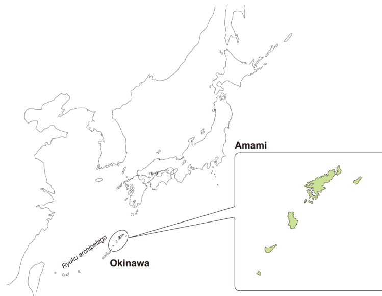
Figure 1. Amami is located southwest of Japan, and together with Okinawa forms a chain of islands known as the Ryukyu archipelago.

nira (local leek/Chinese chives), imoduru (sweet-potato vines), handama (local spinach), togan , unripe papaya consumed as a vegetable, and local fruits such as shimamikan (island-mikan oranges), and passion-fruit. While the Japan Dietetic Association, approved by the Japanese Ministry of Health and Welfare, promotes the use of local food products in their dietary guidelines, and the “Amami Kodakara Project” studied the nutritional breakdown of the “longevity foods” they had raised, there has never been, to the best of our knowledge, an overarching epidemiological study on the protective effects of these “longevity foods” or specific local vegetables and fruits from Amami on death and/or cancer risk to date.