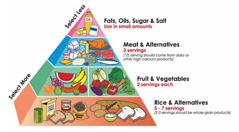
Figure 2. Singapore's Healthy Diet Pyramid (2009)

HPB is in the process of developing guidelines for food advertising targeted at children. One proposal is that food products that run counter to the dietary guidelines ethos