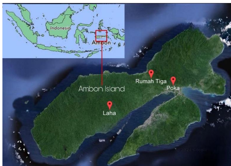
Figure 1. Study location of Poka-Rumah Tiga and Laha Village in Ambon City, Maluku Province, Indonesia

A structured questionnaire was employed to collect data on sociodemographic characteristics, history of infections, dietary patterns, awareness of anaemia, and IFA supplementation. The questionnaire was adapted from two previous national surveys conducted in Indonesia 17,18